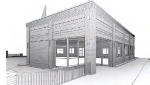
Urgent Care - 3248 Champa